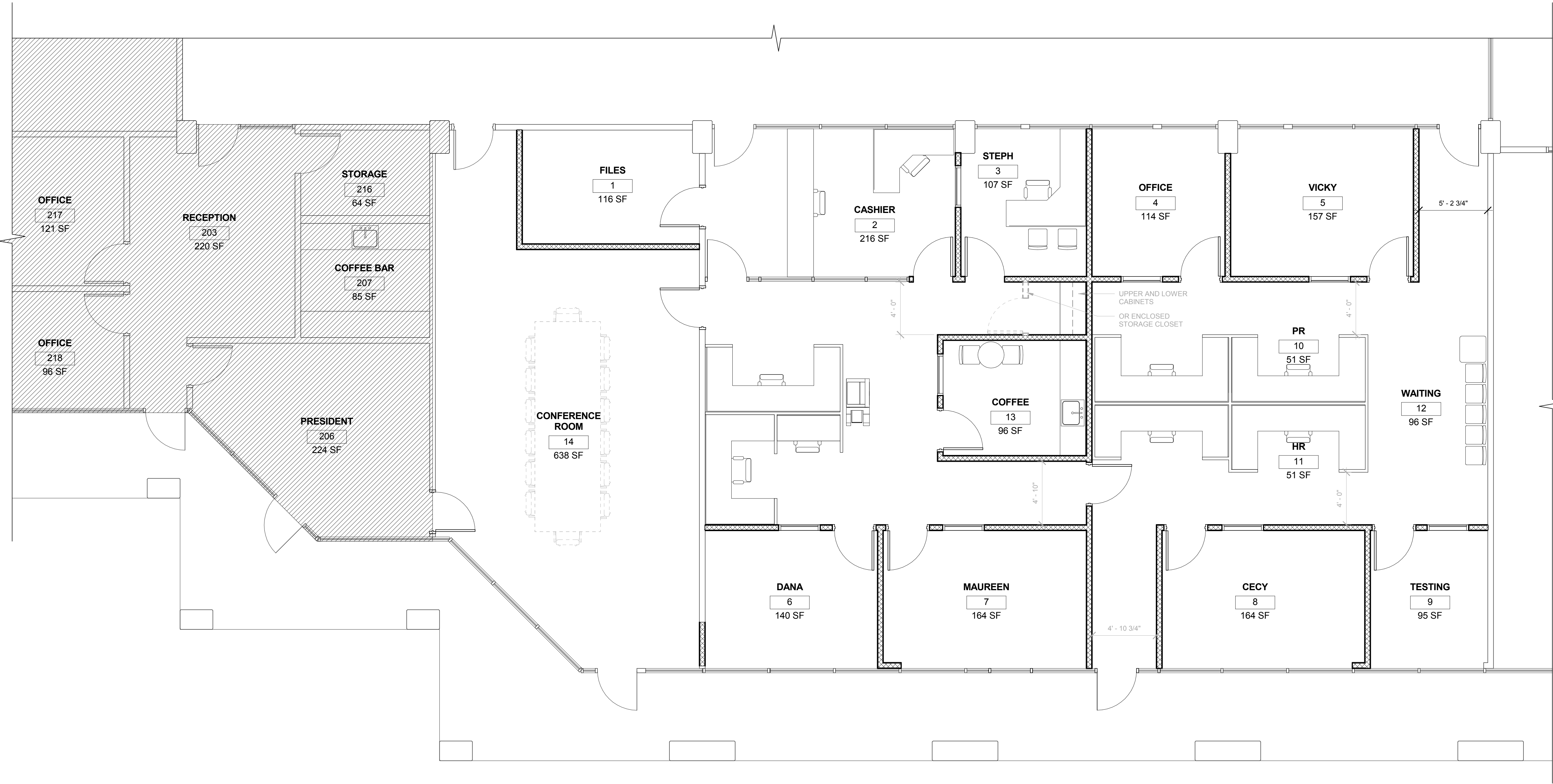
PROPOSED FLOOR PLAN